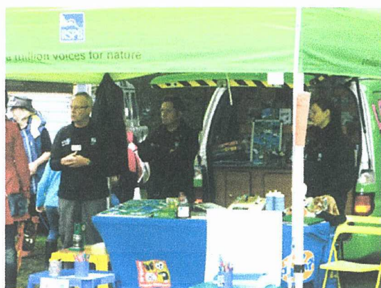
RSPB display stand.