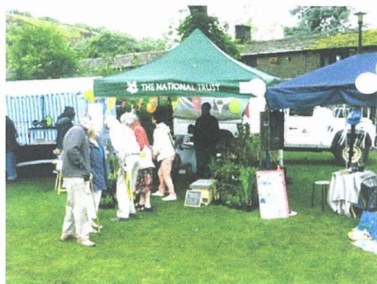
The National Trust stand.