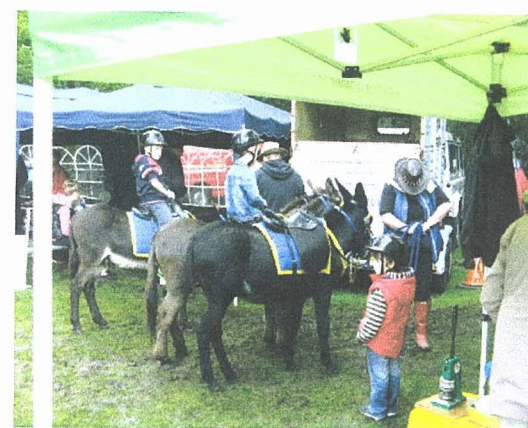
Donkey rides provided by Saddleworth Llama Trekking.