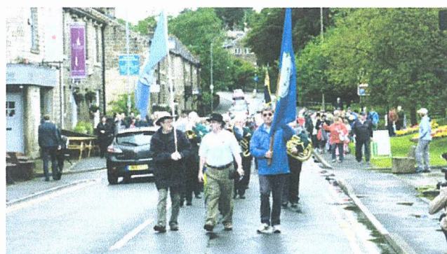
Procession from Saddleworth museum to King George V playing fields.