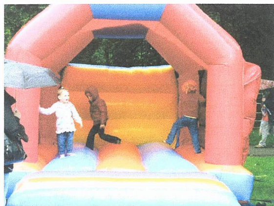
Many children enjoyed the bouncy castle.