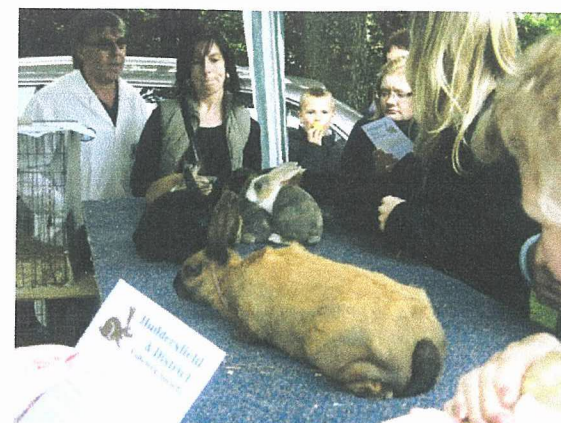
Huddersfield and district rabbit fanciers association. Put on a popular display which attracted a lot of people.