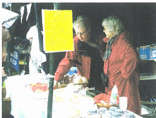
Homemade stall provided by Yorkshire day group.