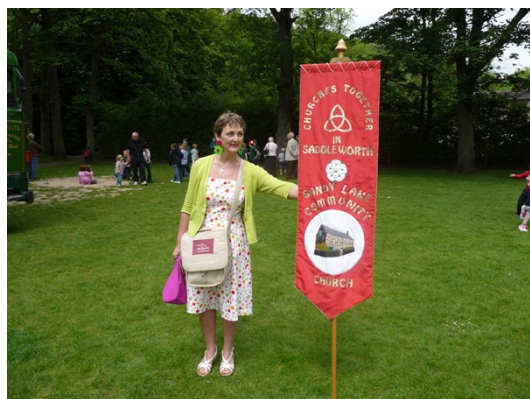
A lady member of the Sandy Lane, Dobcross congregation displays their church banner with the white rose