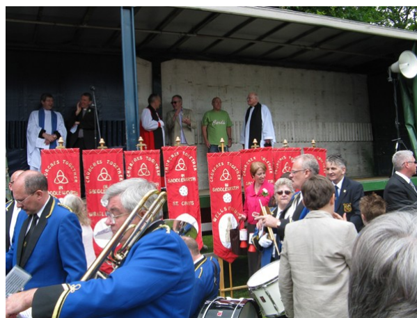
Similar styled banners representing Saddleworth's other churches. Whit Friday 2009.