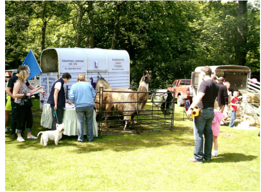
Llamas from Saddleworth Llama Trekking, Denshaw.