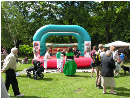
The Bouncy Castle was continuously kept busy by the youngsters.