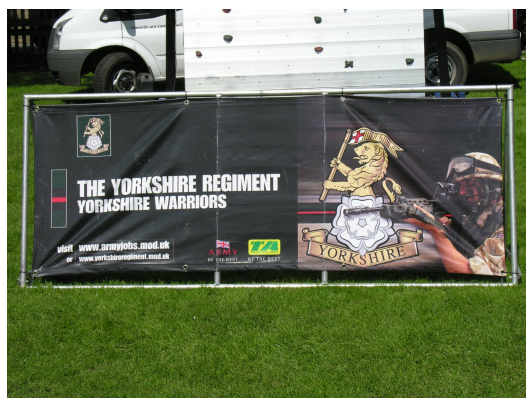
The Yorkshire Regt's recruiting post and display stand and the climbing wall.